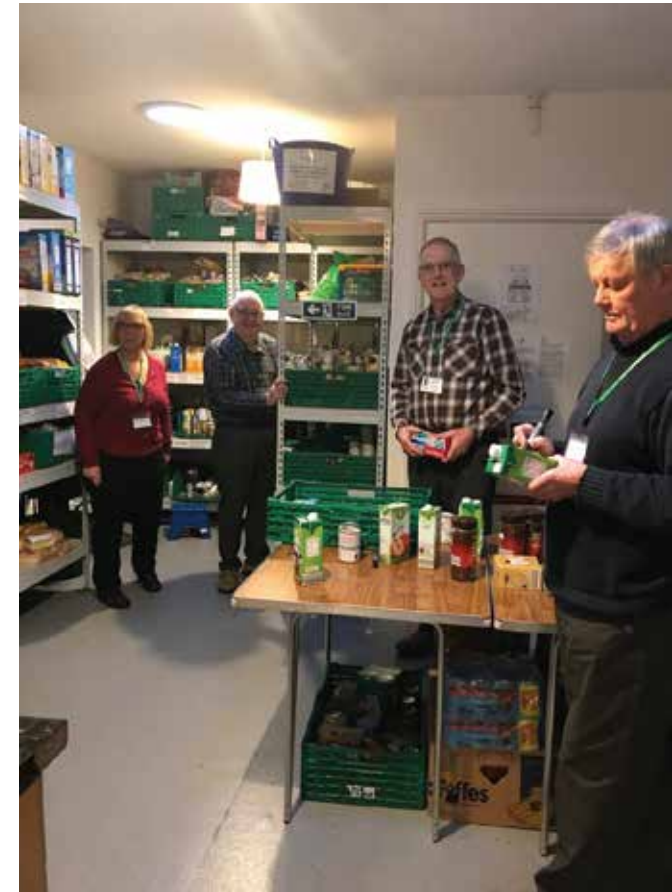
Volunteers, 30 New Lane, Selby. Spot the new boy, two from the right.